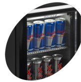
Designed for Energy-cans