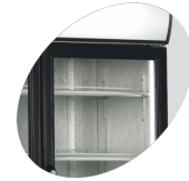
Vertical internal light